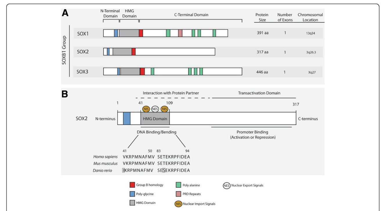
Figure 1 SOX2 homology, structure and protein function. (A) SOX2 belongs to the SOXB1 of SOX proteins. There is large homology between the SOXB1 group and they all contain three major domains: N-terminal, HMG and C-terminal domain. (B) SOX2 protein domains play several functional roles. The HMG domain of SOX2 remains fairly conserved between homo sapiens, Mus musculus and Danio rerio (Swiss-Prot: P48431, P48432, Q6P0E1). The HMG domain also serves as potential binding sites for protein partners. Moreover, nuclear import signals (NIS) and nuclear export signals (NES) bind to the HMG domain regulating SOX2 itself. Lastly the transactivation domain functions as the region responsible for promoter binding, which in turn leads to activation or repression of target genes.

as an oncogene, and controls cancer cell physiology via promoting oncogenic signaling and maintaining cancer stem cells. Lastly, we investigate recent work that has highlighted the role of SOX2 in the clinic, particularly its influence on prognosis, therapy resistance and potential therapeutic interventions.